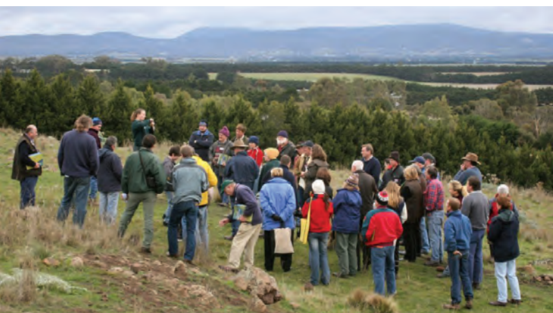
Locals learn about serrated tussock

Along with other Local Governments in Victoria, Macedon Ranges Shire has not wanted to accept a legal responsibility for weed control on roadsides without significant ongoing financial support from the State Government. But it is not in the interests of residents, the local environment or the economy for Council to do nothing and continue to watch weeds spread. Council's investment in weed control supports the local tourism economy, helps reduce fire risk and pest animal harbour. This investment also reduces threats to