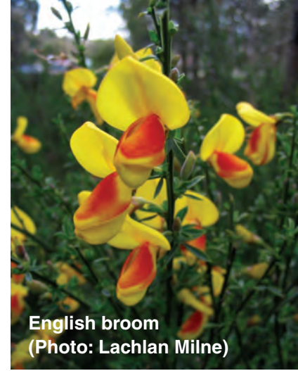
English broom

If you are interested in profiling the work of your local council or community group, please contact the Weedscape Editor.