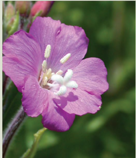
Hairy willow-herb flower with prominent white style