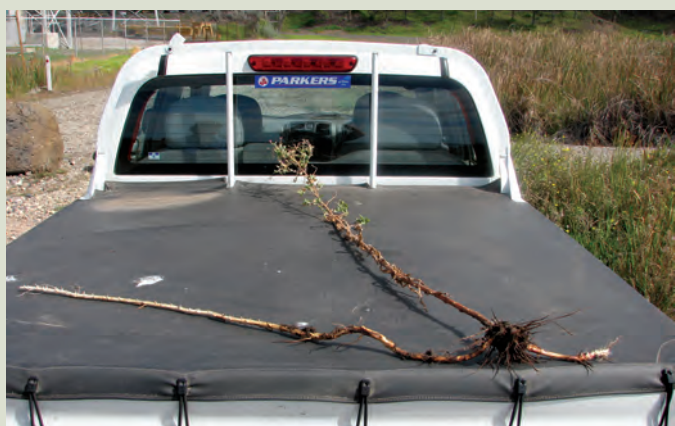
Hairy willow-herb stem and rhizome