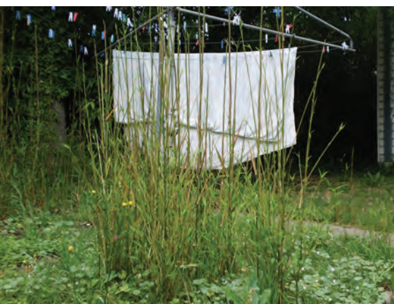
Bamboo in the clothesline

Melbourne has been cursed with the highly invasive golden bamboo for many decades now. If it is planted with no boundaries it will fulfil its duties to invade the whole area. However this is a goodlooking indestructible plant, fantastic for screening or even a stand alone specimen plant in just about any conditions.