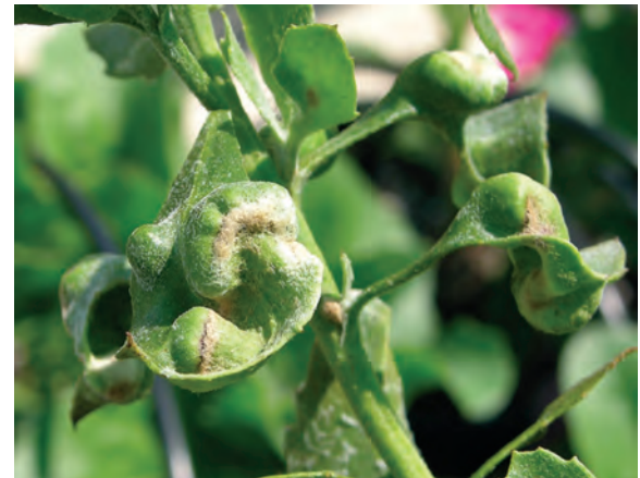
Damage caused by the boneseed leaf buckle mite

posters were presented, all of which were published in a dedicated edition of the journal Plant Protection Quarterly (Vol. 23, No. 1, 2008). Stakeholders participated in a facilitated session to determine future directions of the bitou bush and boneseed program. Nine priority actions were identified and are listed in the table on page 4, in order of importance.