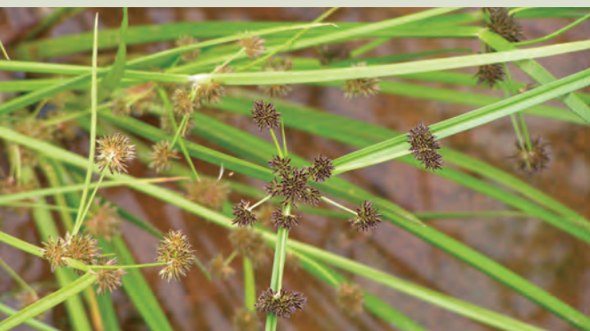
Cyperus difformis