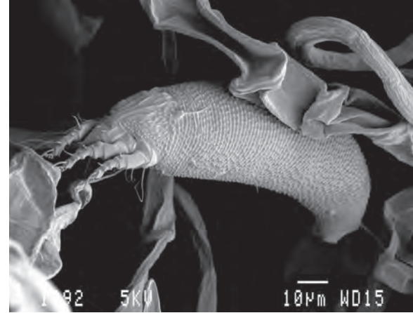
Microscopic image of the boneseed leaf buckle mite