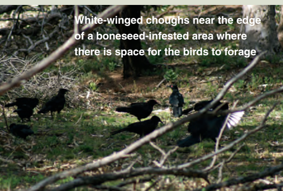
White-winged choughs near the edge of a boneseed-infested area where there is space for the birds to forage

Efforts to control the spread of boneseed in the You Yangs have concentrated on mechanical destruction, application of chemicals, biological agents and manual pulling of the plants. The advantage of the manual pulling method is that it specifically targets boneseed plants with minimal effects on soil, native plants and wildlife. The main disadvantage is that it is labour intensive, so its success depends upon volunteers. If large numbers of enthusiastic boneseed pullers were paid to do the job, what an impact that would make on these invasive weeds. Realistically, control is the only possibility, not eradication , so a funded program would be long-term and therefore expensive.