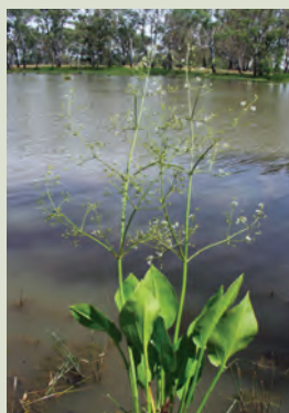
Nymphaea (left) Water Plantain (right)