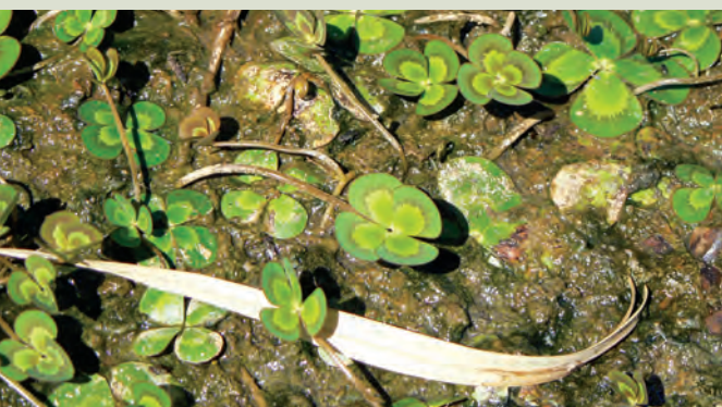
Marsilea mutica , Lake Boga, Victoria