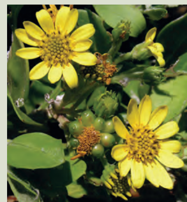
Boneseed (left) and bitou bush (right): closeups of flowers, fruits and leaves