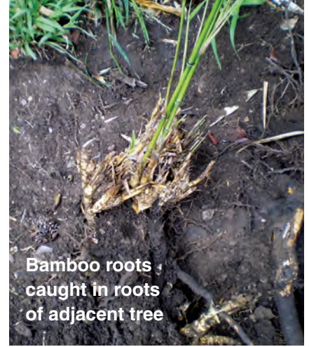
Bamboo roots caught in roots of adjacent tree