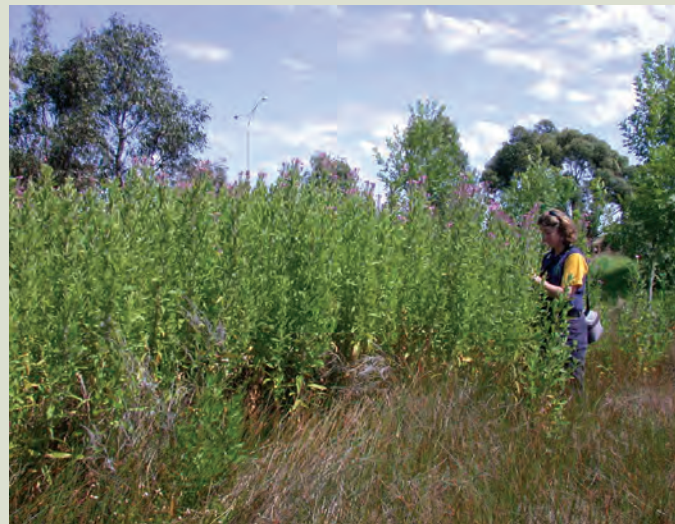
Hairy willow-herb infestation at Geelong